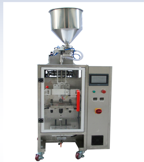
MODEL SP 240 WITH LIQUID PISTON FILLER